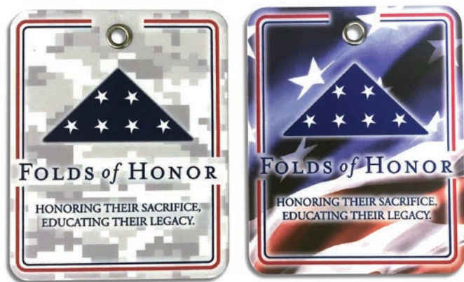
SIDE 1 OPTIONS