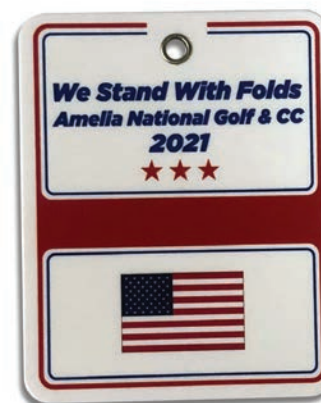
SIDE 2 CUSTOM

CHOOSE BETWEEN 2 OPTIONS FOR SIDE 1 SIDE 2 IS CUSTOM TO YOUR EVENT